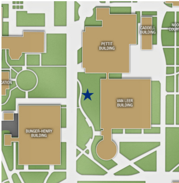
Figure 1. Preferred Location on GT Map

We looked at potential locations surround Van Leer and the new courtyard near the College of Computing.