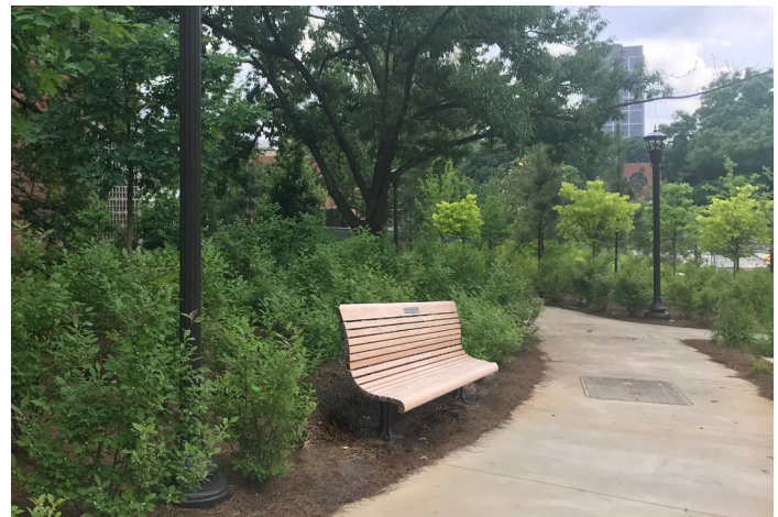
Figure 2. Render at Particular Location

The location that stood out best to us is located on the side of Van Leer “off the beaten path.” It seems as though this would be a good place to reflect.